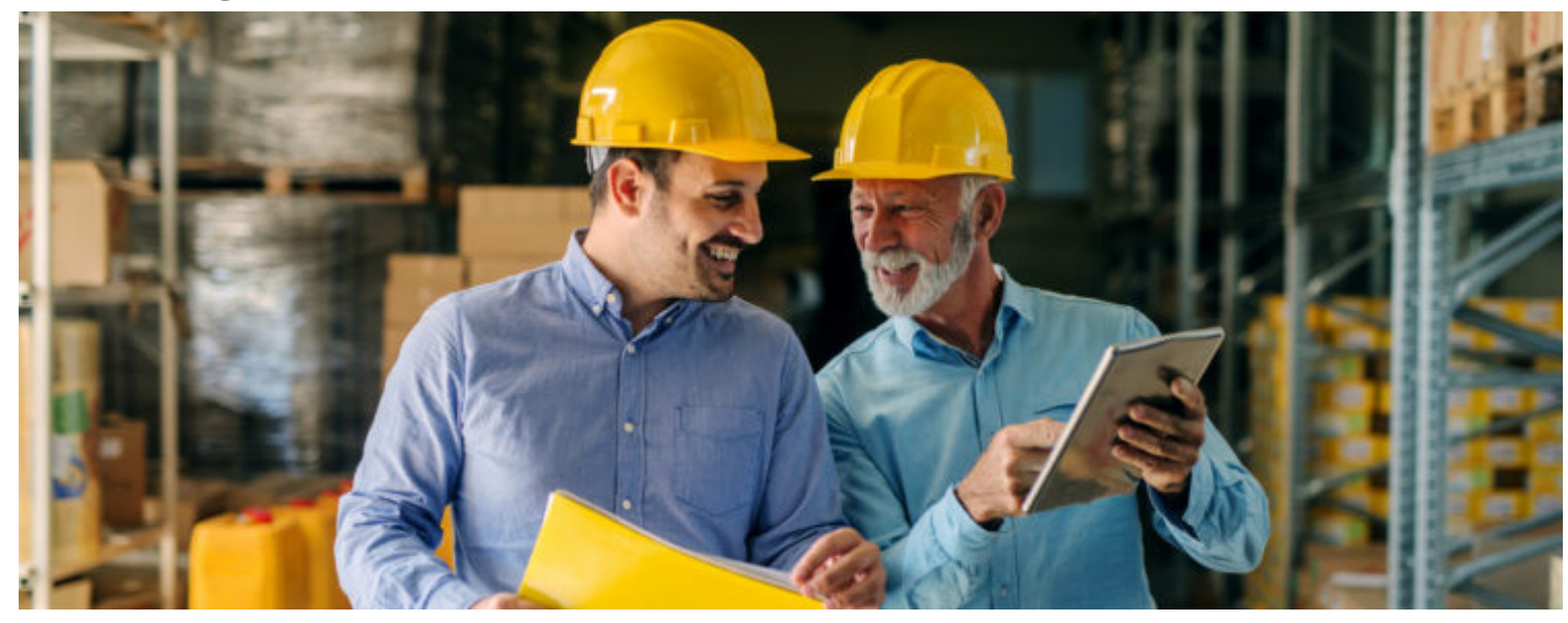
[Article was originally posted on www.nav.com]